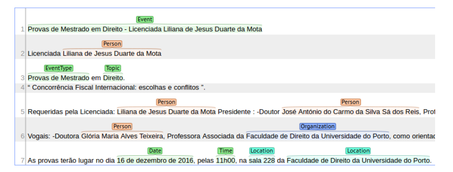
Figure 2 Example of an annotated fragment of text, for a SIGARRA news, in the Brat rapid annotation tool.

the link to "Information Retrieval" was directly established, "Departamento de Engenharia Informática" indirectly received a high popularity weight because it is partOf "Faculdade de Engenharia da Universidade do Porto".