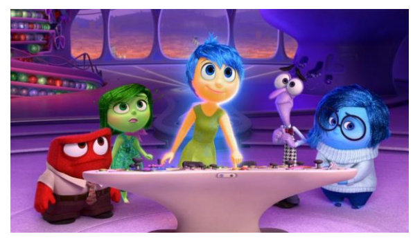
Figure 3. Inside Out movie's personified emotions at the mind control panel of the movie's main character

A particularly inspiring artistic approach has come fore in 2015 in the movie Inside Out. In this movie, each character's mood and actions are determined by his/her own emotions, personified as internal characters at a control panel: Joy, Fear, Anger, Disgust and Sadness (Fig. 3). Rather than using it as an explanatory metaphor, we can envisage this approach as a configuration metaphor, by controlling which persona is in control or a similar metaphor. While this is possibly a basic, oversimplified approach, one may propose its evolution into a more complex and scientifically-sound representation of a character using concepts such as the dimensional models of personality traits employed by the American Psychiatric Association for assessment of personality disorders [6].