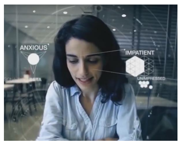
Figure 2. Mood and emotional elements can be part of a character's configuration

(Image still from the video Sight, retrieved from <u>https://www.youtube.com/watch?v=IK_cdkpazjI</u> on July 18, 2016.)