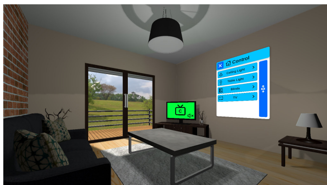
FIGURE 1. VE used for the experiment trials. The VE consisted of a virtual living room of a smart house, where object states could be remotely controlled.

participants were naive to the experiment. Each participant performed the experiment twice using a different menu. Since there were four menus in total, and to balance the order each was performed, the participants were distributed by 12 groups varying the order of the two menus assigned to each, with every group having at least 4 participants (Table 1).