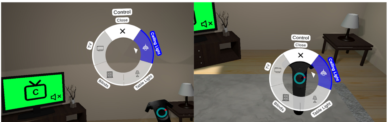
FIGURE 3. Radial menu type with the main menu options and the “Ceiling Light” option selected. The selection was made by placing the finger in the circular touchpad on the controller (red dot). On the left is the wall placement and on the right is the hand placement.