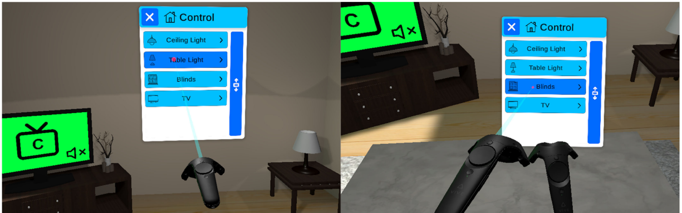
FIGURE 2. Panel menu type with the main menu options. Selection was made by pointing the controller at the menu. On the left is the wall placement and on the right is the hand placement.