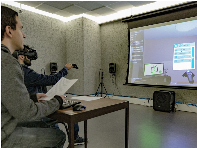
FIGURE 4. Participant seated in the experiment site, with the equipment, and ready to perform the experiment.

and once comfortable with it, the experiment scenario was loaded, and the experiment protocol took place with the first menu. Once finished, the participant filled the SUS and ASQ questionnaires. After this, the steps mentioned above were followed again for the second trial, using a different menu. Before leaving, participants filled the menu comparison questionnaire.