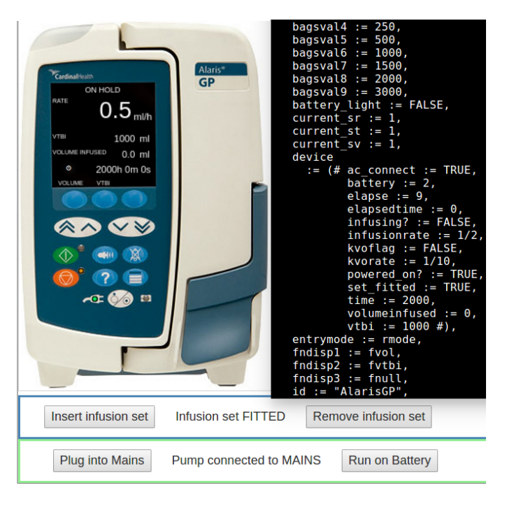
Fig. 2. Simulating the PVS model of the pump