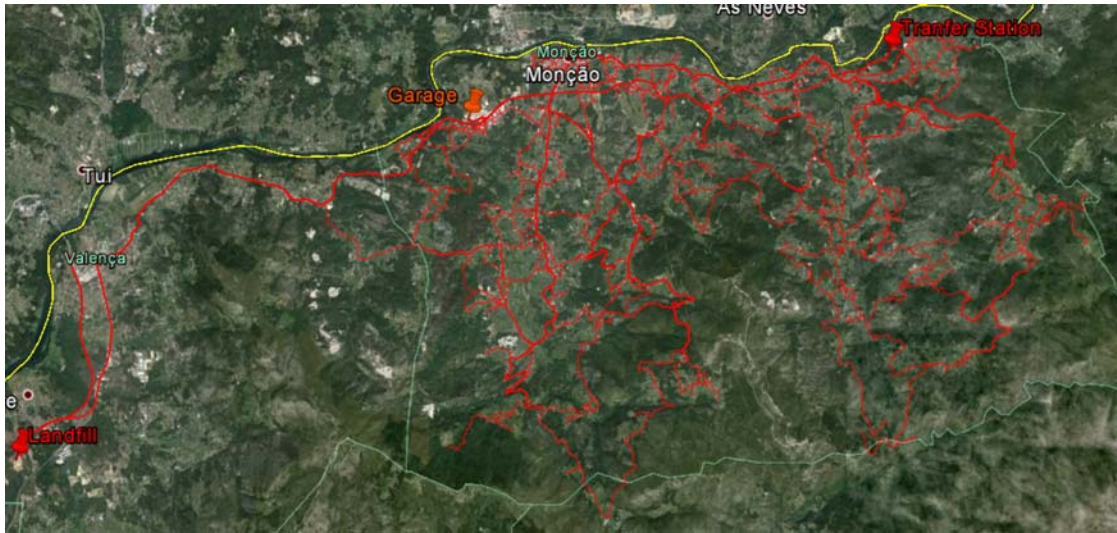
FIG. 1. The region of Monção by Google Earth. [Color figure can be viewed in the online issue, which is available at wileyonlinelibrary.com .]