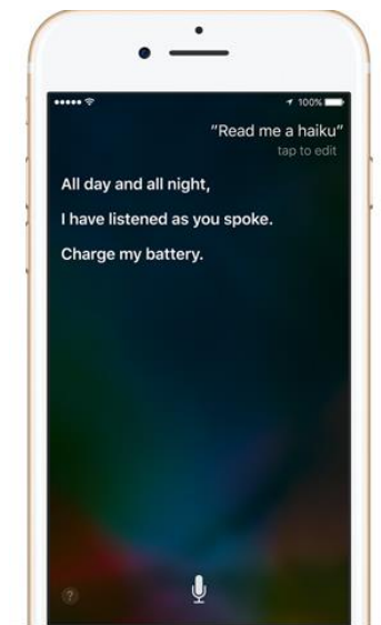
Fig. 3. - Siri launched on an iPhone

The Apple Siri is an Intelligent Personal Assistant that allows communication with the user through voice commands. It is capable of search online, make reservations at restaurants, manage email and make calls. This Intelligent Personal Assistant is integrated with iPhone, iPad and Apple Tv. With the Home app, the user can with Apple Siri control lights, thermostats, door locks and other sensors. The user can communicate with Apple Siri in English, French, Danish, Finnish, Spanish, Japanese, Mandarin, Portuguese and others languages. In Fig. 3 it is presented the Apple Siri launched on an iPhone.