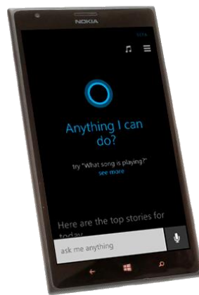
Fig. 4. - Microsoft Cortana launched on a Nokia smartphone

The Microsoft Cortana is an Intelligent Personal Assistant that allows communication with the user through voice commands. It is capable of search online, dictate emails and solve mathematical equations. To answer the questions online, Microsoft Cortana uses the Bing Search Engine. The user can communicate with Microsoft Cortana in English, French, Spanish, Italian, Japanese and Mandarin This Intelligent Personal Assistant is integrated with Windows 10, Android , Xbox One and iOS platforms. In Fig. 4 it is presented the Microsoft Cortana launched in a Nokia smartphone.