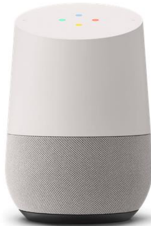
Fig. 1. - Google Home Smart Speaker

The Google Assistant is an Intelligent Personal Assistant that allows communication with the user through voice commands. It is capable of search online, set reminders and play music using Spotify. This Intelligent Personal Assistant is integrated with Google Home, Google Allo messaging application and Android Wear (e.g. Smartwatches). The Google Assistant is available in English, German, Hindi, Japanese, and Portuguese. In Fig. 1 it is presented the Google Home Smart Speaker which has builtin Google Assistant.