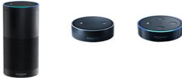
Fig. 2. - Amazon Echo Smart Speaker

turning lights on/off or adjusting the temperature at home. The Amazon Alexa is available in English or German. In Fig. 2 it is presented the Amazon Echo Smart Speaker which Amazon Alexa's integrates.